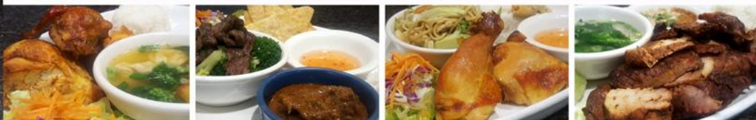
#1 Half BBQ Chicken & Wonton Soup