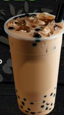
THAI ICED TEA WITH BOBA